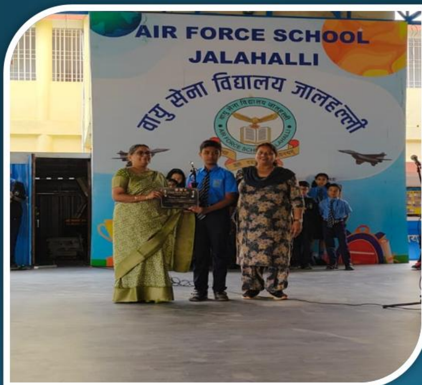
DRISHAAN - CLASS VII